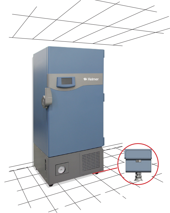
Freezer placement and leveling